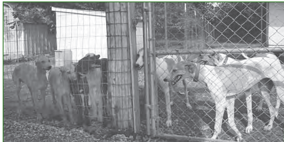
As the hounds age, they move to different areas of the farm. In the beginning, they run together with their littermates. The most successful runners may move on to a racing kennel at a track.